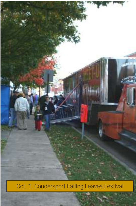
Oct. 1, Coudersport Falling Leaves Festival